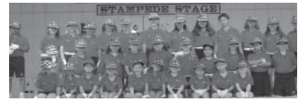
The Singing Hands of Paso Robles

NACM gratefully acknowledges the support of Robert Tall and Associates for the use of the Roland Grand Piano at the conference.